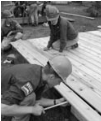
The VYCC hard at work on the cedar decking for the Waterbury railroad station.

The Vermont Youth Conservation Corps is a non-profit youth, service, conservation, and education organization that instills in individuals the values of personal responsibility, hard work, education, and respect for the environment. Each year, the VYCC hires young people aged 16-24. Currently headquartered in Waterbury, VYCC will be moving to the restored Monitor Barn on Route 2 in Richmond later this summer.